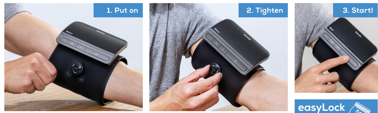
Whether at home or on the move - the all-in-one design makes blood pressure measurement easier and more convenient than ever before!

With the new BM 81 easyLock , annoying tubes and cables are a thing of the past. Thanks to a new design with integrated cuff, you can measure your blood pressure anywhere and at any time. The innovative easyLock system makes it easy for you to fix the device on your upper arm with the perfect fit and secure hold - without the need for a hook-and-loop fastener. The all-in-one solution for your health!